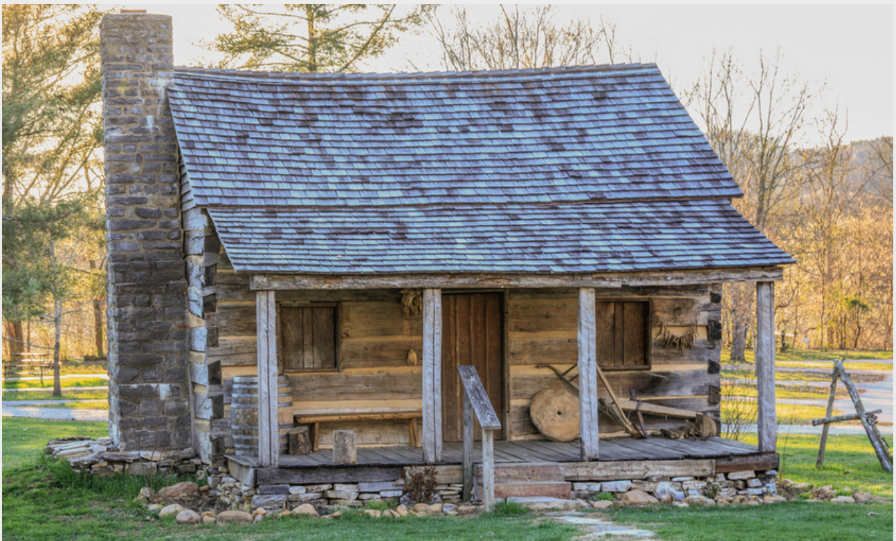
David Crockett Birthplace State Park, Limestone, TN, A replica of the 1786 birthplace cabin of David (Davy) Crockett stands at the edge of a campground