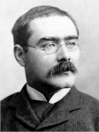
Bro. Rudyard Kipling (1865-1936)