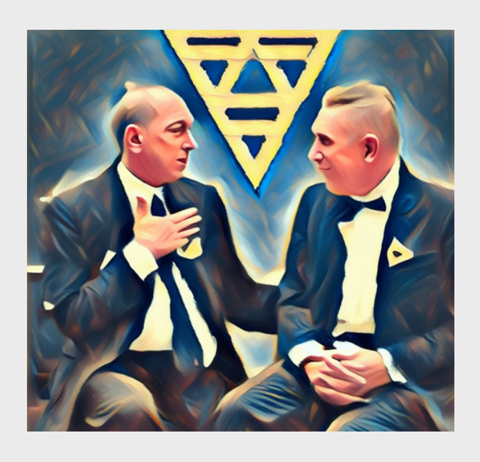
"I'm Sorry" vs. "Please Forgive Me"

Apologies are a fundamental aspect of human interaction, serving as bridges to mend relationships and rectify mistakes. However, not all apologies are created equal. There exists an art to the apology, one that distinguishes between saying "I'm sorry" and "please forgive me" based on their motives. This art correlates with the principles of Freemasonry, which aims to refine individuals and make good men better.