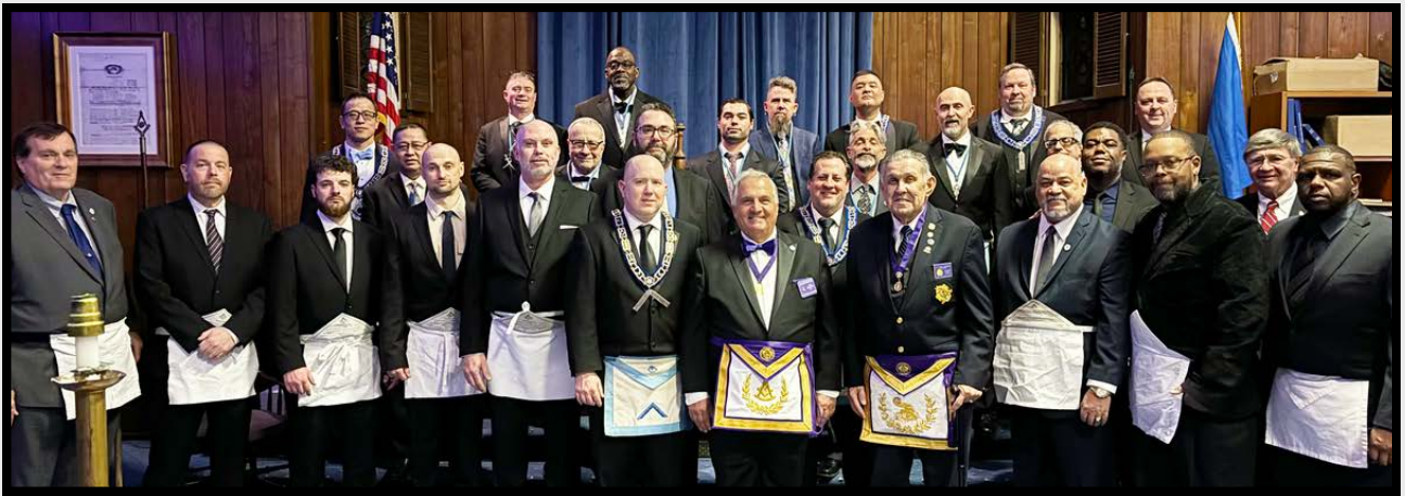
April 4th, 2024 Entered Apprentice Degree