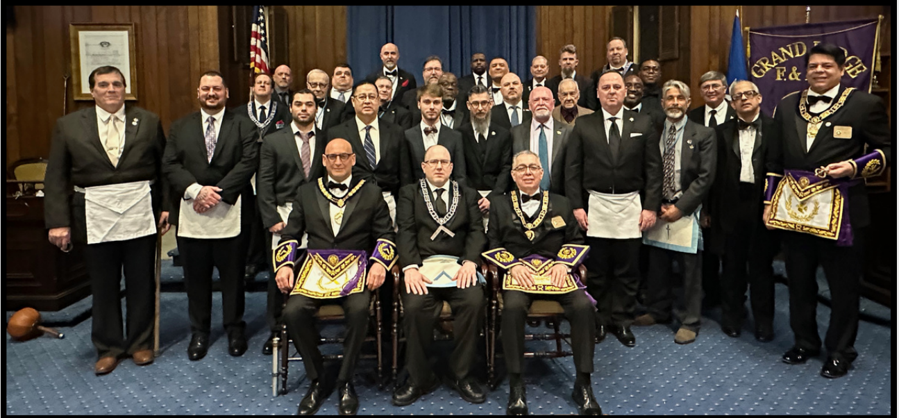
Feb. 29th, 2024 Master Mason Degree

In the early months of 2024, Suffolk Lodge No. 60 AF&AM witnessed remarkable moments of growth and brotherhood, underscoring the enduring values that have been the cornerstone of Freemasonry. These events not only enriched our lodge but also highlighted the promising future shaped by our newest members.